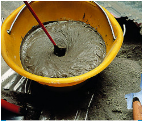
Nivorapid mixed with mechanical mixer