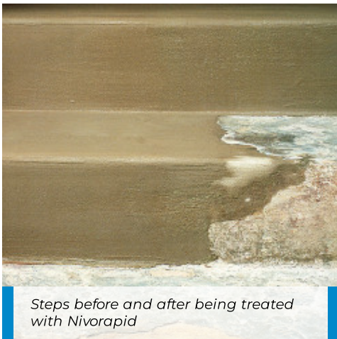
Steps before and after being treated with Nivorapid