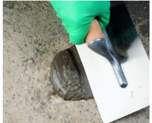
Repairing horizontal arrises with Nivorapid