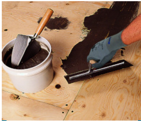
Grouting a plywood substrate with Nivorapid + Latex Plus