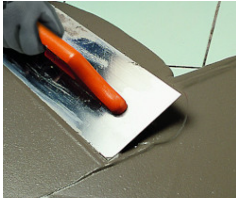
Levelling of existing floor with Nivorapid