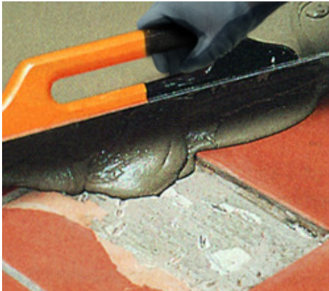
Filling holes with Nivorapid